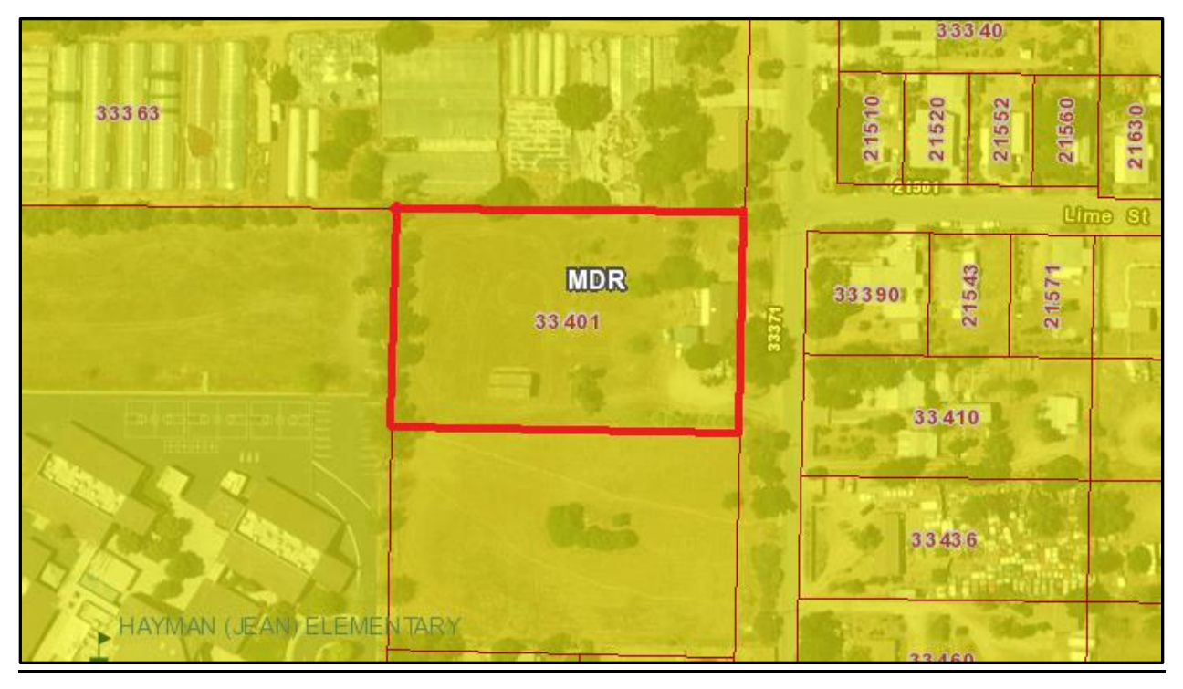
Figure 2. General Plan Existing Land Use Exhibit