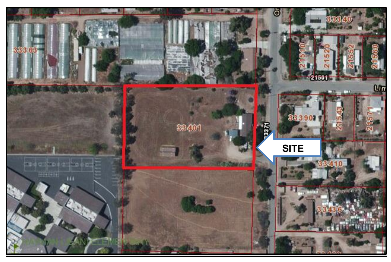
Figure 1. Vicinity/Location Map

<u>Surrounding Land Uses:</u> The project site is surrounded by both residential uses to the north and west, vacant land to the south and Jean Hayman Elementary School to the east. The summary table on the following page lists the current land uses, general plan land use, and zoning designations for the site and abutting properties. Staff has also provided two exhibits (on the following pages) showing the general plan land use and zoning designations from our GIS data base.